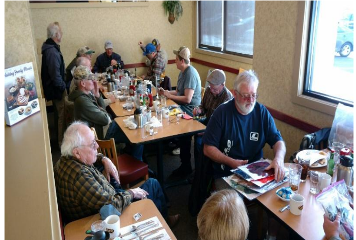
A Typical Bug Club Meeting