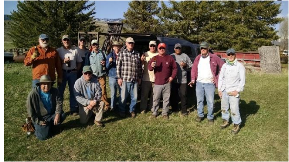
Fence deconstruction crew, celebrating at the end of a long and very productive day

More project photos at: snakerivercutthroats.org