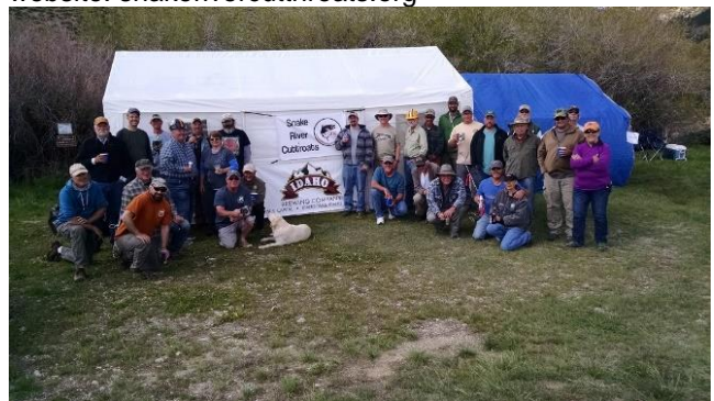
Most of the crew at the end of the day

More project photos are in the Recent Updates or Conservation section of the Snake River Cutthroats website: snakerivercutthroats.org