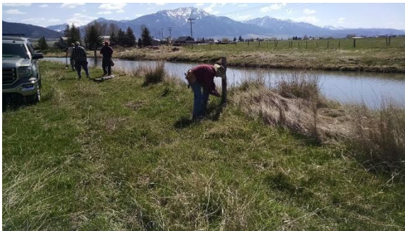
Jim pulling staples

Before the new fence can be built, the old one needed to be removed. To help keep costs down, the Snake River Cutthroats agreed to remove the old fence, which was a combination of 4- and 5-strand barb wire with a few sections of sheep fence, just to make things more interesting. In addition to the wire, all the old fence posts (a