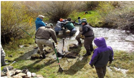
Securing logs with rebar

The rain and hail started in earnest on Friday afternoon, but waited until we had set up the cook tent and rain fly. A steady rain started again around 2:30 Saturday morning but had mostly quit by the time we had our meet and greet and safety meeting at 8:30. So, the dismal beginning in the morning turned into a gorgeous day and a very pleasant evening for our steak bbq on Saturday.