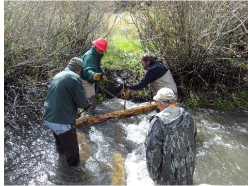
Getting things to fit required perseverance.

Twenty sites were identified for this year's project. Most required placing log structures in the stream, held in place by rebar. The logs were drilled and placed next to the stream before we arrived, saving us some time. But to keep the logs from floating off the rebar, the holes are undersized to ensure a tight fit. So, pounding the rebar through the logs was the first order of business. The rebar is driven into the logs with sledge hammers while they remain on the bank and finished once the log is properly placed.