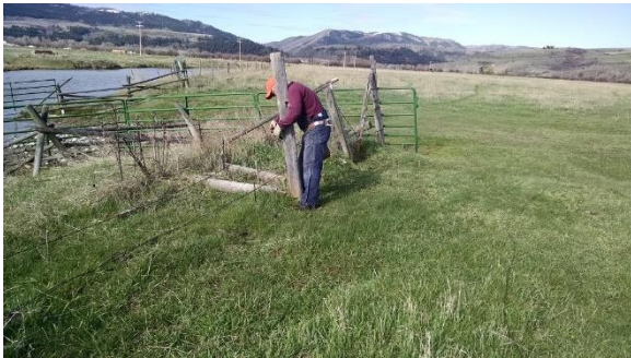
Rory removing old wire

With $14,000 in funding from the Snake River Cutthroats—money raised at the East Idaho Fly Tying and Fly Fishing Expo, Matt Woodard (Trout Unlimited Project Manager) will be overseeing the replacement of approximately a mile of an existing fence and a water gap on lower Rainey Creek. The new fence will be set back further from the stream bank to allow riparian planting of willows, dogwoods and possibly other species. The bigger, longer term objective is to secure funding to restore the segment of Rainey Creek flowing through the Griffel ranch, basically narrowing the channel to provide deeper water, and to construct more riffle and pool sections – all more suitable habitat for fish.