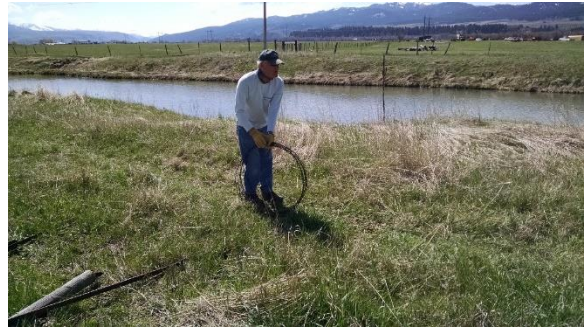
Riley rolling up old barbwire

combination of wood and steel) had to go as well. SRC volunteers left the parking lot at Matt's office at 7:30 and got back that evening around 7 p.m. It was definitely a long day.