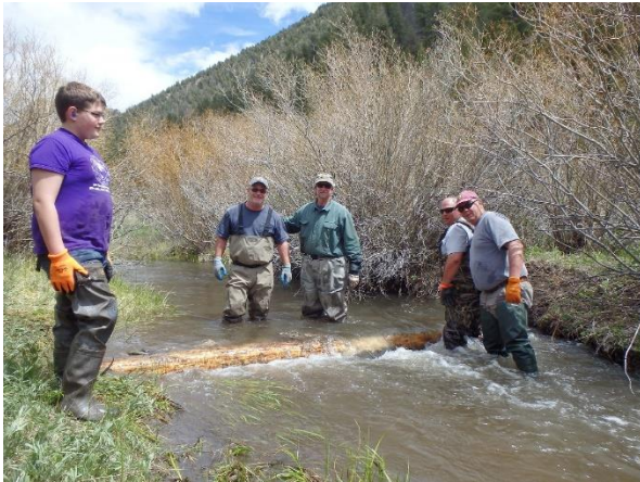
2017 Canyon Creek Project