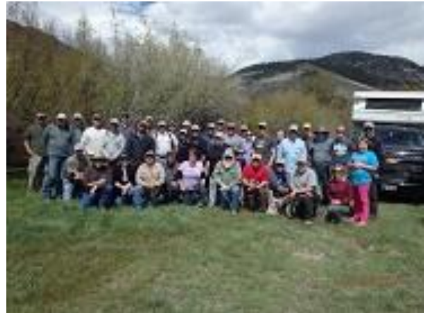
2017 Canyon Creek Project Crew