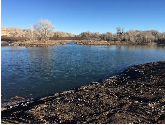
Pete's Pond, November, 2017