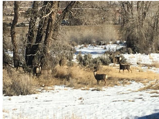
Results of Pete's Pond tranquility