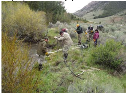
Willow planting with water jet stinger

Forest Service biologist Craig Hemping who directed the project had plans to place root wads or to plant willows at 30 sites. Willows will provide shade and stabilize eroding stream banks, while the root wads help reduce erosion, stabilize stream banks and provide fish habitat. We finished all the sites by mid-afternoon and returned to the Smokey Cub campground to prepare and enjoy the traditional steak bbq.