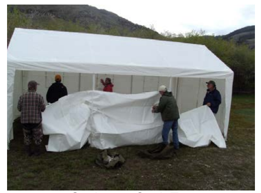
Setting up Cook Tent

For the 28th consecutive year the Snake River Cutthroats conducted our springtime conservation project in the Salmon/Lemhi River drainage. This year's project was on Canyon Creek, a Lemhi River tributary east of Leadore. This is the third project that the Cutthroats have done on Canyon Creek. This project is part of a Forest Service five year plan to restore four miles of Canyon Creek. Canyon Creek was reconnected to the Lemhi a few years ago, which will ultimately restore previously lost spawning habitat for anadromous fish. The weather was a bit more challenging this year. So it was really nice to have Buck's "tent" for cooking.